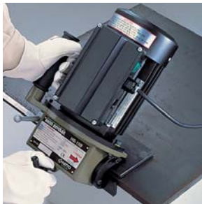
Beveling steel plates