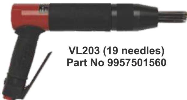
VL203 (19 needles) Part No 9957501560