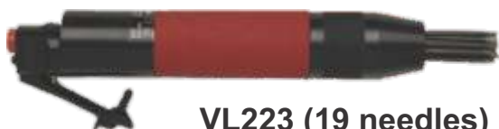
VL223 (19 needles) Part No 9957501590